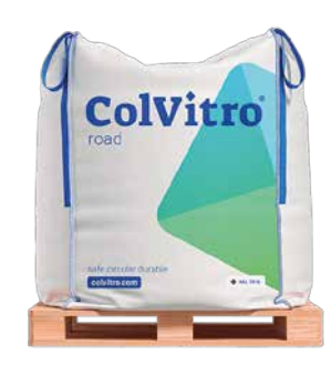
Big bags (1,000 kg)